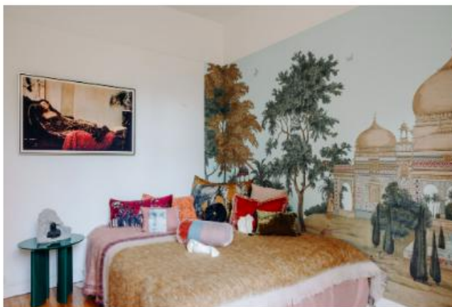
The bedroom: © Galerie Villa Gabrielle.