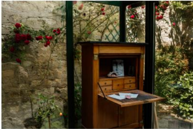
View of the veranda with two white plaster sculptures by Marina Mankarios and a photograph on marble by Dune Varela.

established names with deep-rooted cultural heritage. The gallery's artistic direction is shaped by themes of ancient memory and reinterpretation of art history, which offers timeless collections that merge archaeological inspirations and contemporary writing.